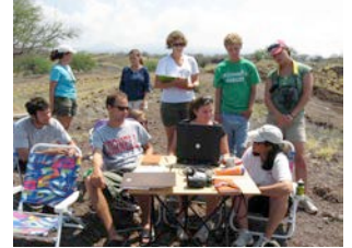
CORNELL STUDENTS AT THE SHORE STATION (ABOVE) AND ON A COMMERCIAL WHALE WATCH (BELOW).

I have truly enjoyed interning with the HMMC. I have learned an unbelievable amount about real world and hands on oceanographic studies, and formed a relationship with the organization that I will remember for a lifetime. Most of all, I feel glad to have contributed to the HMMC's goal in providing an educational outlet to the community – my way of giving back to the island for the amazing education it has given me.