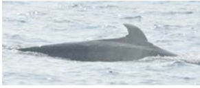
FALSE KILLER WHALE, HIPc316, SEEN NORTH OF KAWAIHAE