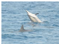
SPINNER DOLPHIN BREACHING NEAR KAWAIHAE

As in previous years, humpback whales were the focal species of our 2012 field season. In our continuing efforts to determine whether there is a link between the size of singers and characteristics of their song, locating singers was our primary objective. In 2012, we obtained fluke measurements from 11 singers and recorded 10 individuals, totaling almost 8 hours of humpback whale song. This work was made possible using equipment funded by grants we received in 2010/2011 from the Norcross Wildlife Foundation. Data analysis is ongoing and you'll be the first to know what we discover!